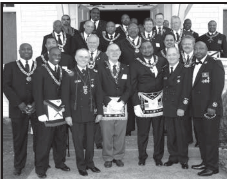
16th Annual March of Unity, both Grand Lodges working together.