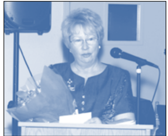
Lady Nancy at the District 8 Reception of the Grand Master.

On several occasions, I have addressed what I call the "10 Percent Solution." It is based on the assumption that all our Lodges have an active participation of somewhere between 10 and 25 percent of the total Lodge membership. Our statistical history has shown that we have a trend of between 5 to 7½ percent loss in total membership annually. This loss is composed of between 4 to 6 percent due to death, 1 to 2 percent dropped for non-payment of dues (NPD), and 1 to 1½ percent being issued dimitts. Now for the solution, if every one of the active participants (the 10 to 25 percent) will replace themselves this year, 2006, we will show a positive growth of 2 ½ to 5 percent. Being conservative, I suggest that just 10 percent of us need to replace ourselves. Let me assure you this is doable as several Lodges were able to do so in 2005,